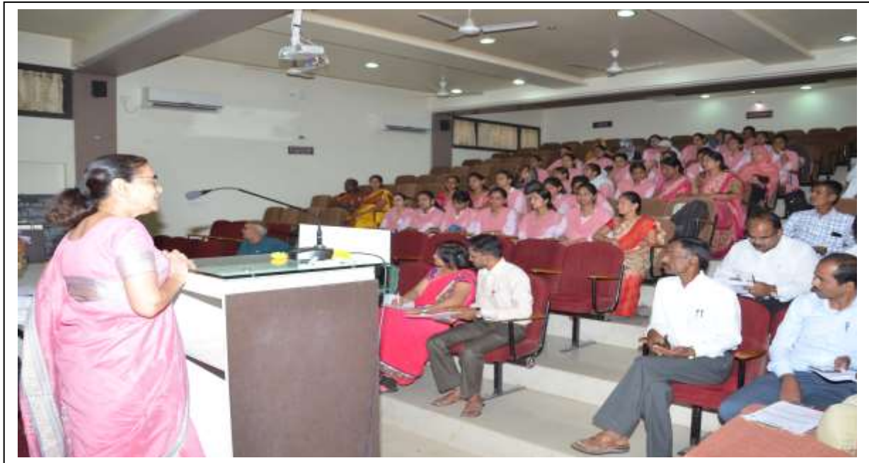
Keynote address- Hon. Smt. Alka Kakade-Counselor